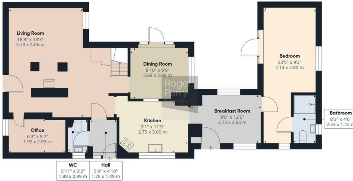
Ground floor Building 1